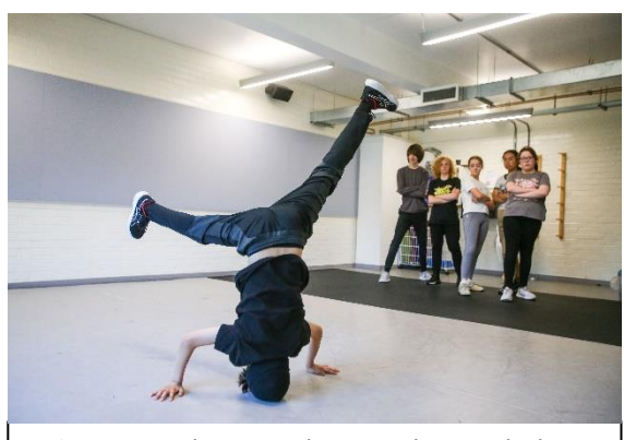
CAT street dance students working with their teacher in rehearsals.

It is important that all students attend, as any student who does not attend their compulsory Intensive may not be able to perform in the show or be able to fully participate in weekend rehearsal sessions over the terms.