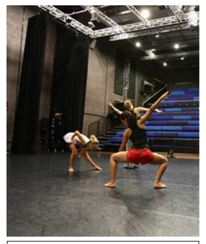
CAT students rehearse in the Dance City Theatre.

Having good attendance is vital for your training so that you can gain the most from your CAT classes and continue to progress and improve, with the support of your teachers. CAT staff strive to ensure the lowest injury rate possible and the most important factor in reducing the likelihood of injury is regular attendance at CAT classes.