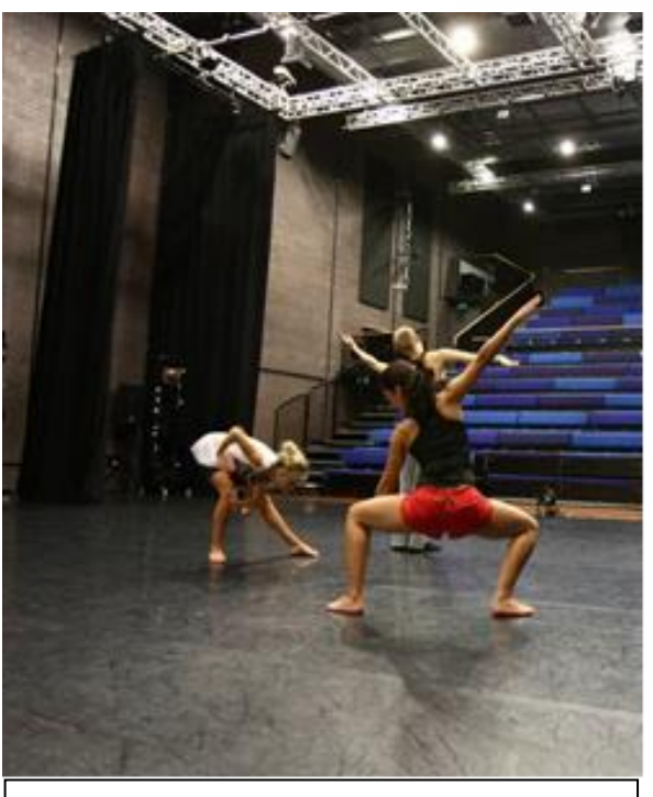
CAT students rehearse in the Theatre.

Weekend attendance is particularly important in the run up to a show in order that teachers can prepare the choreography properly for the performance. It is not possible for a