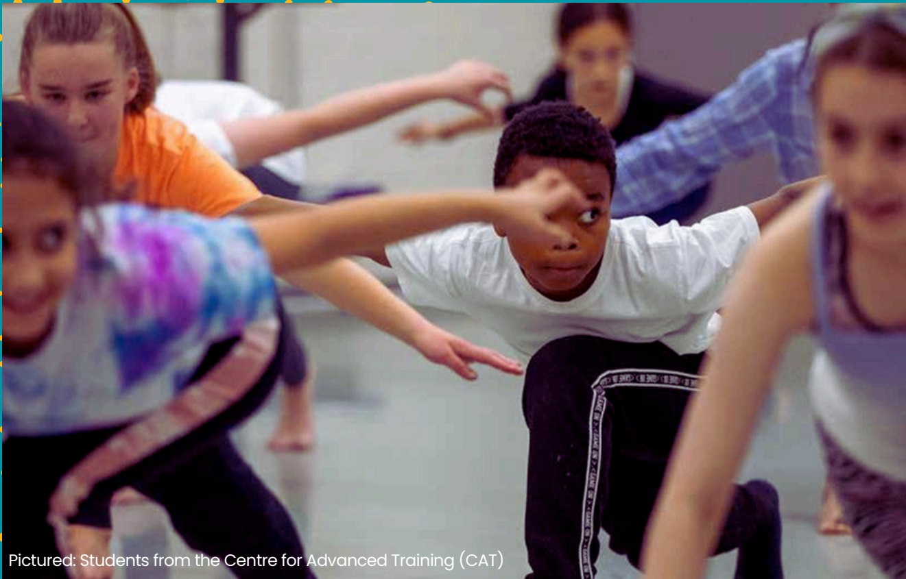
Pictured: Students from the Centre for Advanced Training (CAT)